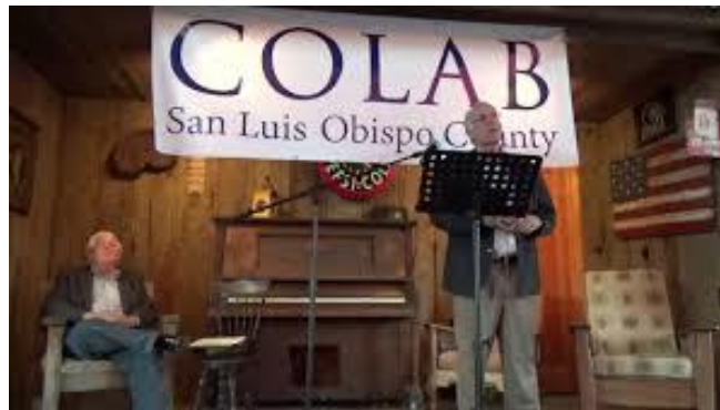
VICTOR DAVIS HANSON ADDRESSES A COLAB FORUM