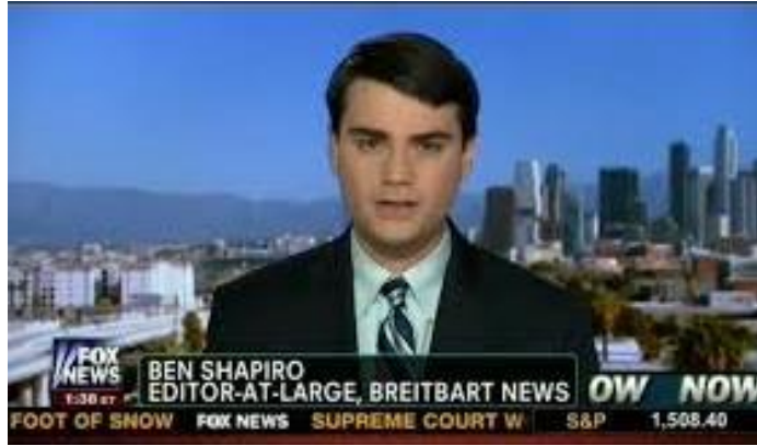
AUTHOR & NATIONALLY SYNDICATED COMMENTATOR BEN SHAPIRO APPEARED AT A COLAB ANNUAL DINNER